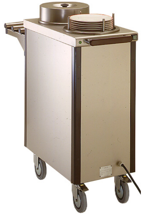
CMS + accessories

The range of heated plate lowerators consists of 2 models, 1 model, without castors, for plates with a maximum diameter of 255 mm and 1 model, with castors, for plates with a maximum diameter of 310 mm, both supplied with covers.